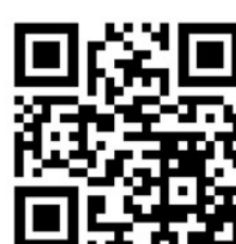
High Fliers Padlet

Departments also invite guest speakers to visit the school. On 5 December 2025, BHS was delighted to welcome the Right Honourable Wes Streeting MP, Secretary of State for Health and Social Care and Member of Parliament for Ilford North. During his visit, Mr Streeting delivered an inspiring keynote speech to students in Years 9 and 12, sharing his personal journey into politics, his role in government, and his commitment to addressing local and national issues.