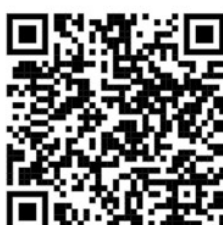
Wider Reading Lists